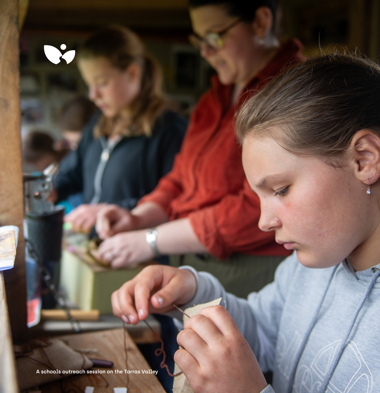
A schools outreach session on the Tarras Valley

First published by The Langholm Initiative January 2025