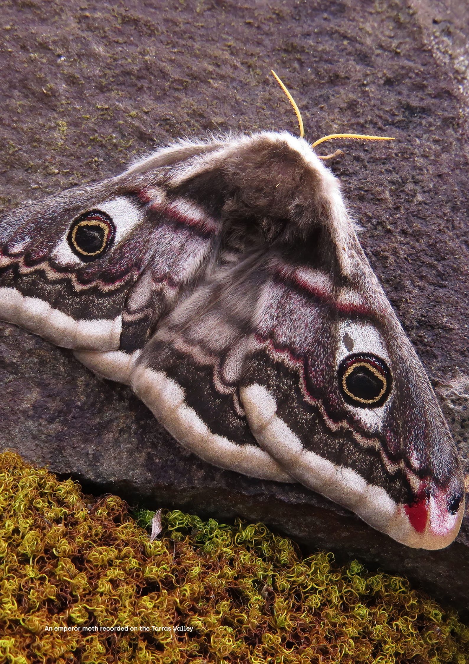
An emperor moth recorded on the Tarras Valley