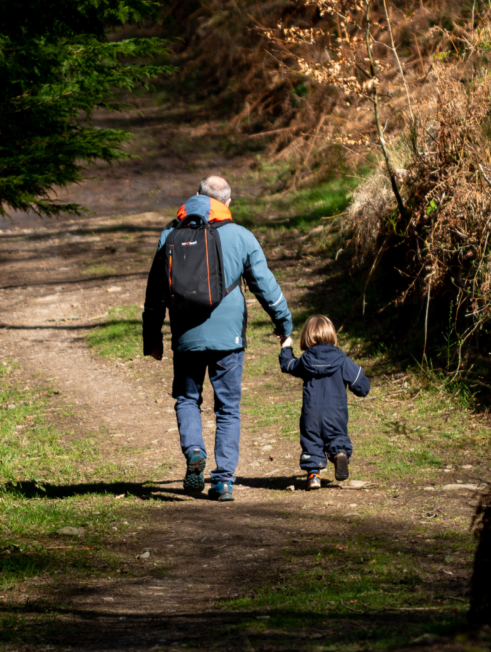
A family walk through ancient woodlands in Longwood