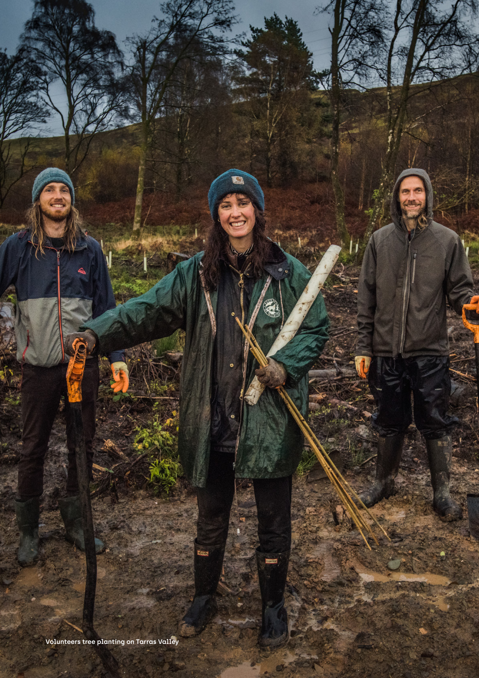
Volunteers tree planting on Tarras Valley